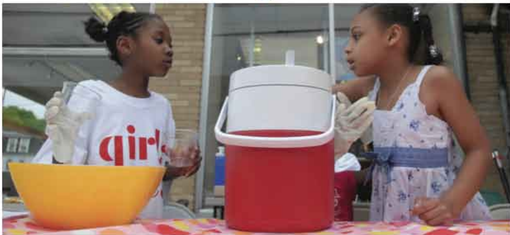
> Two girls sell lemonade to raise money for Girls Inc., and to learn business skills.